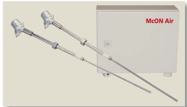
Figure 1: McON Air Box

The first raw mill installation in North America in 2004 was in Midlothian, TX on two mills. The high moisture content required higher than normal air flow to dry the material and the mill ID fan power consumption was about 60 % of the